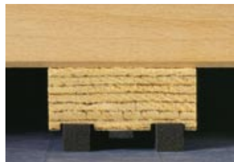
Rubber strips in unloaded position.

UnoBAT 50 is a resilient batten-based sports floor system suitable for multi-purpose sports halls. UnoBAT 50's veneer battens feature a unique arrangement of specially developed rubber strips on the underside. The outer and inner strips differ in density - low density on the outside and high density on the inside - to produce a 2-step absorption effect with a deformation limit, which delivers optimum shock absorption and ball bounce consistently across the entire floor's surface.