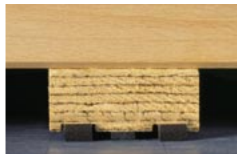
Rubber strips with maximum load (note that the outer strips are never squeezed to destruction level thanks to the centre strip and their recessment).

UnoBAT 50 offers the performance attributes necessary for fast moving ball games while keeping the risk of injury at an absolute minimum.